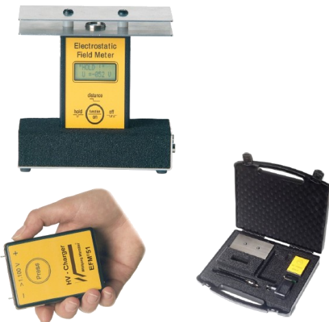
EFM51.CPS Charge Plate Kit

7100.EFM51.VK: EFM51 Verification Kit 7100.EFM51.WT: EFM51 Walking Test 7100.EFM51.CPS: EFM51 Charged Plate System 7100.EFM51: EFM51 Electrostatic Field Meter