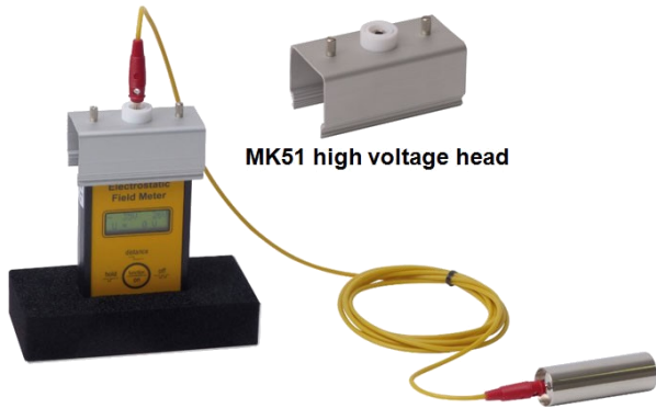
MK51 high voltage head